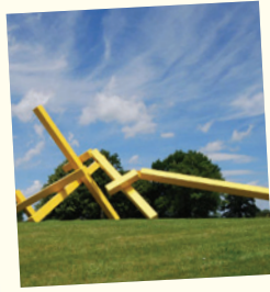
Nathan Manilow Sculpture Park