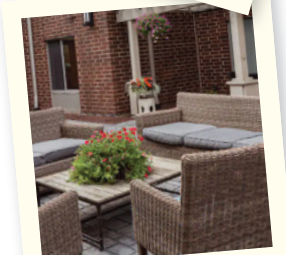
Homewood Suites by Hilton Orland Park