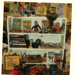
1950s Park Forest House Museum