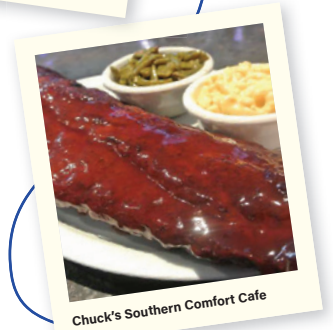
Chuck's Southern Comfort Cafe