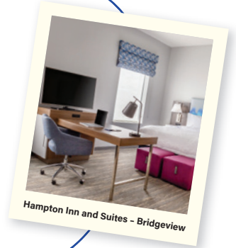
Hampton Inn and Suites - Bridgeview