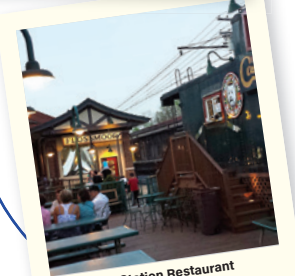
Flossmoor Station Restaurant & Brewery