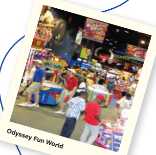
Odyssey Fun World