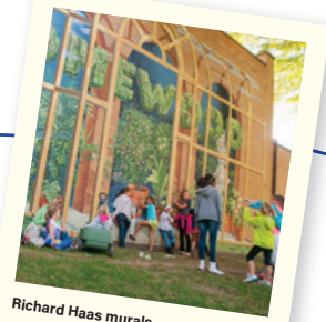
Richard Haas murals

Many attractions have reopened with limited capacity or different operating hours. Inquire with attractions ahead of time for up-to-date travel policies and health and safety information.