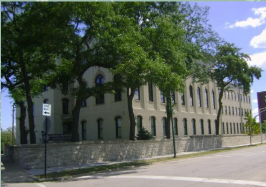
Soldier's Home – Civil War Hospital 3525 South Lake Park Ave.

Douglas Camp soon earned the nickname... "Eighty Acres of Hell"