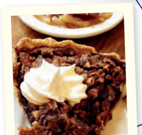
My Just Desserts