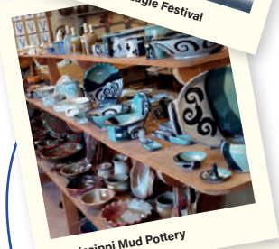
Mississippi Mud Pottery