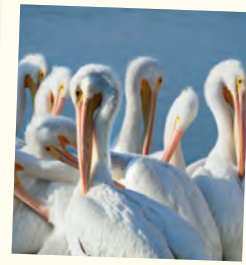
Two Rivers National Wildlife Refuge