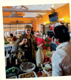
Grafton Winery & Brewhaus