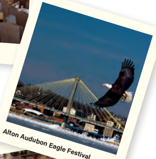
Alton Audubon Eagle Festival