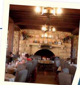
Pere Marquette Lodge