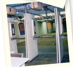
Darnall's Gun Works and Ranges