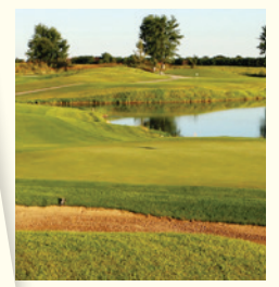
The Den at Fox Creek Golf Course

Many attractions have reopened with limited capacity or different operating hours. Inquire with attractions ahead of time for up-to-date travel policies and health and safety information.