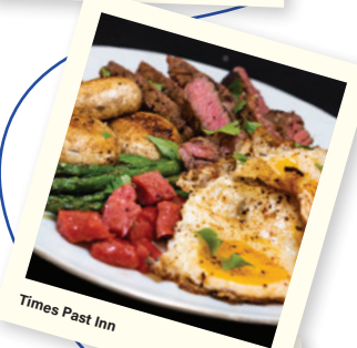
Times Past Inn