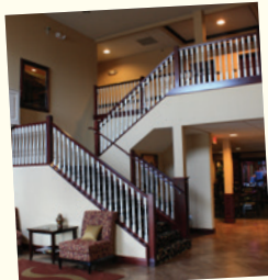
Parke Regency Hotel and Conference Center