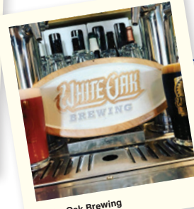
White Oak Brewing