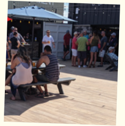
Lil Beaver Brewery